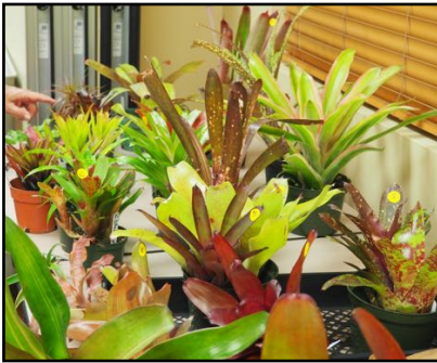
Sale Table Selection