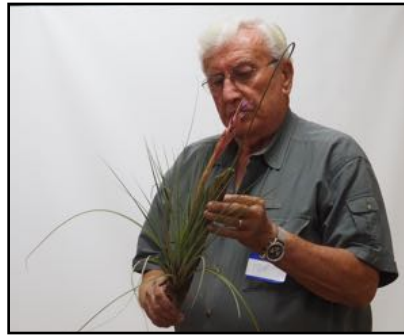
Till x Floridana