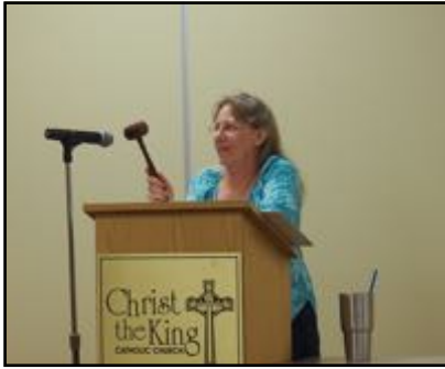
Call to Order