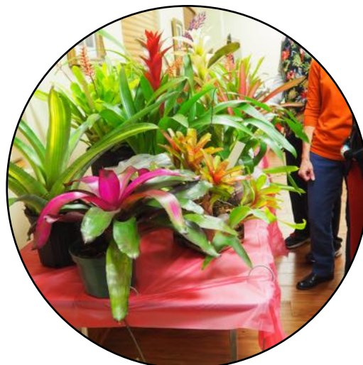
Beautiful Auction Table!