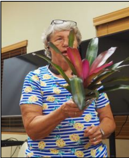
Neo 'Purple Star' - variegated shown by Verna Dickey