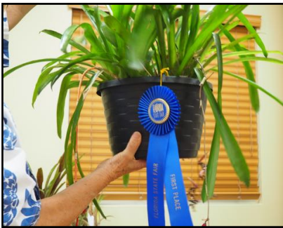
Verna's State Fair prize-winning Ae. Weibachii pendula