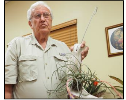
Tom Wolfe - Till. baileyi