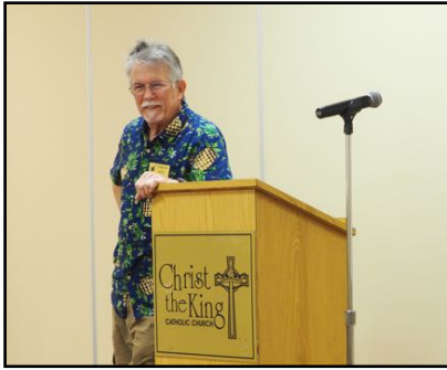
Call to Order